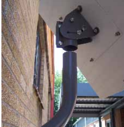
Figure 6 – Pole collar