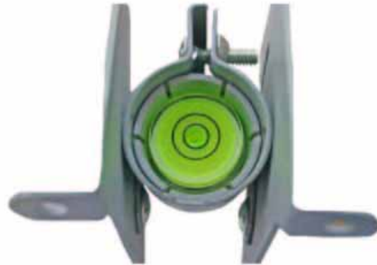
Figure 3 - Bubble level