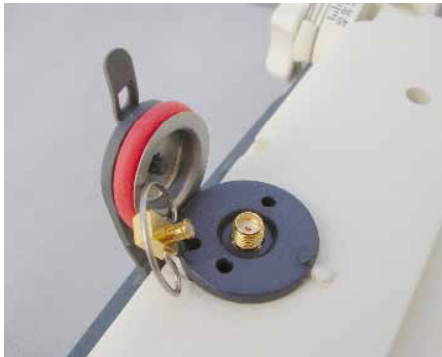
Figure 8d – Insert strain relief adapter flush with terminal housing