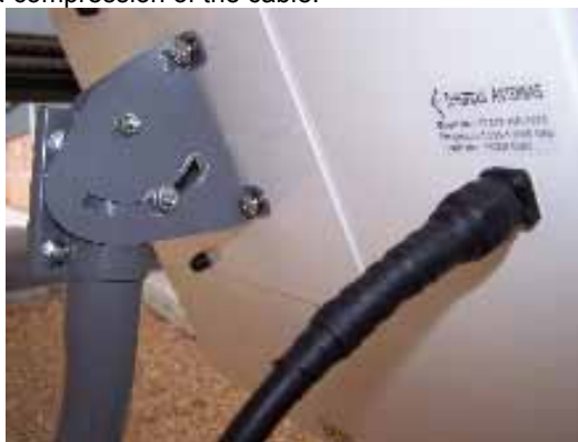
Figure 7 – Weatherproofed Connector