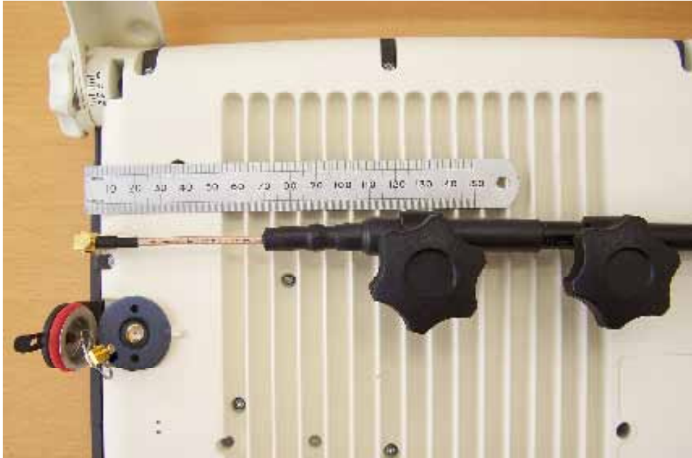
Figure 9a – Attach antenna feed cable