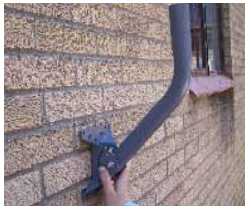
Figure 4 - Pole assembly