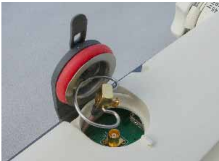
Figure 8b – Disconnecting the MCX connector

The MCX connector is prone to damage. Ensure that the utmost care is taken when mating and unmating the connectors. This connection must not be made more than 100 times.