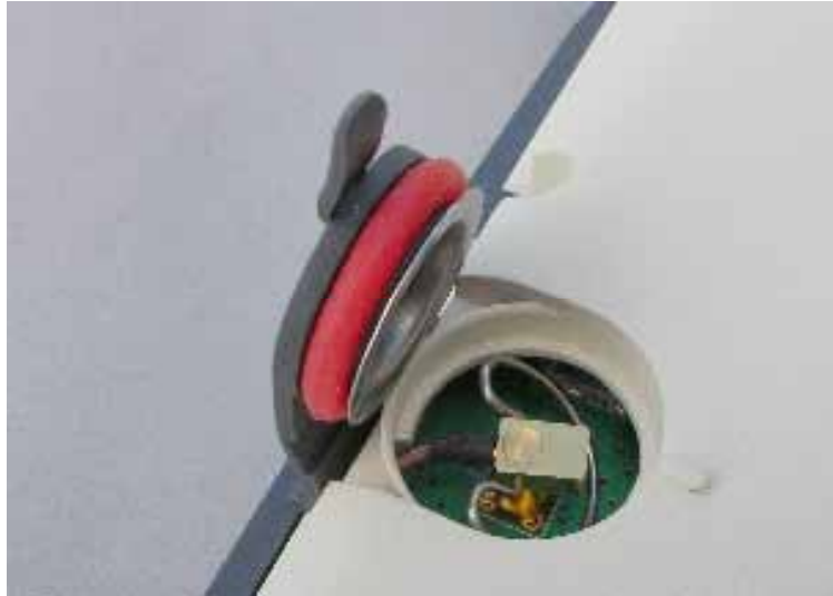
Figure 8a – Opening the rubber plug