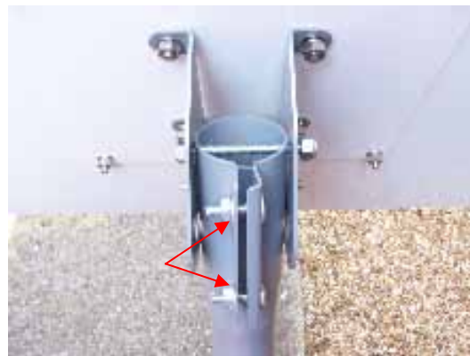
Figure 11 – Adjusting azimuth