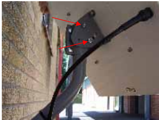
Figure 10 – Adjusting elevation