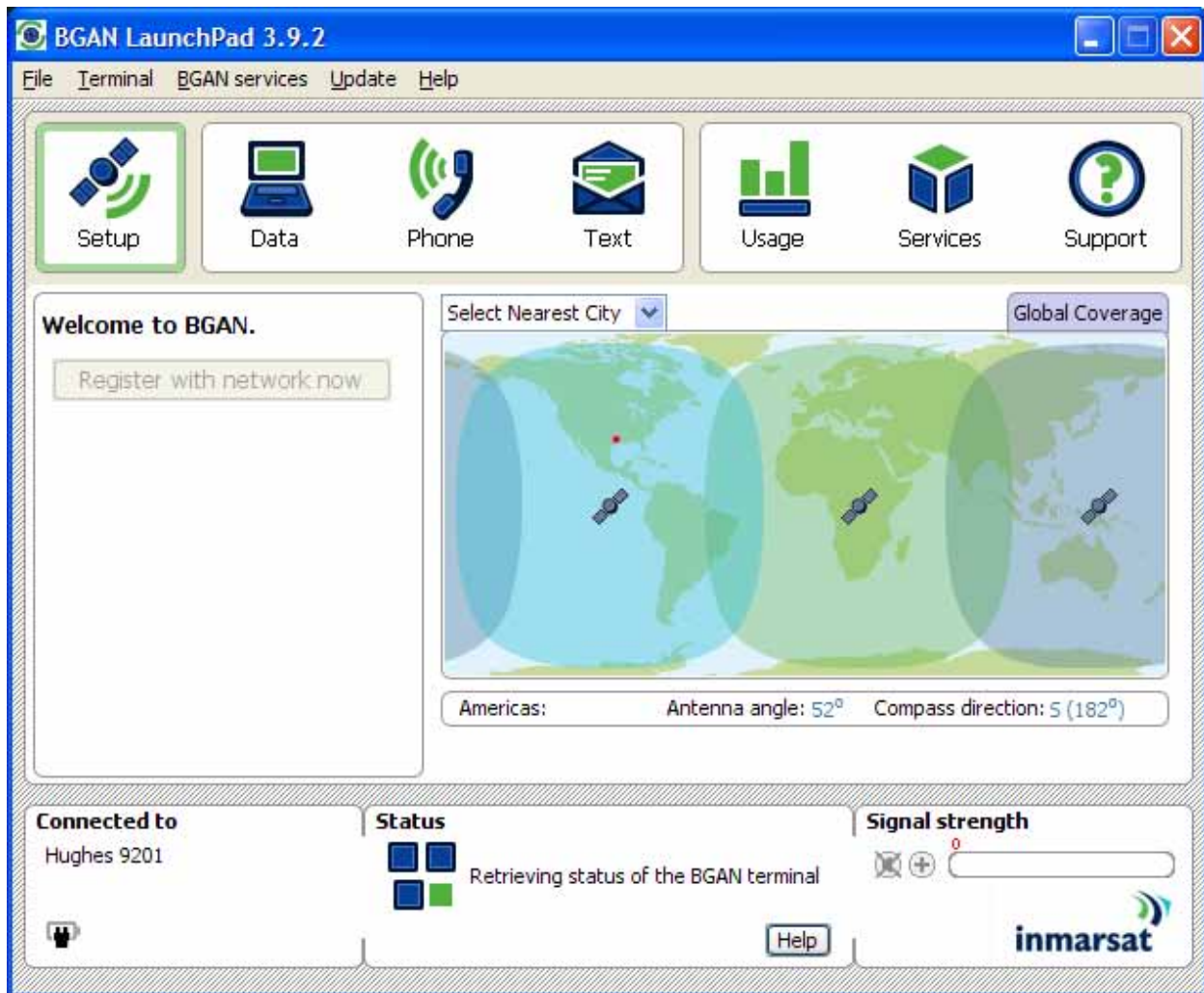
Figure 1 - LaunchPad Setup screen showing the recommended antenna pointing angles