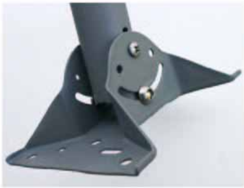
Figure 2 - Base bracket