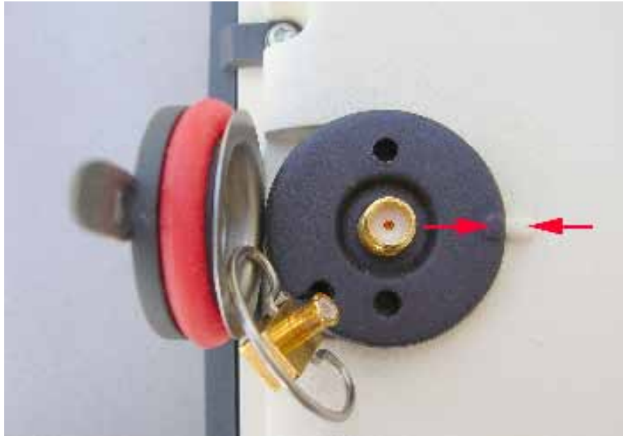
Figure 8c – Alignment of strain relief adapter