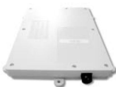
AXONN AXTRACKER SIMPLEX TRANSMITTER

$ 495.00* – Battery operated $ 595.00* – Battery operated with DC line power/charging option (external automotive power cable required, sold separately)