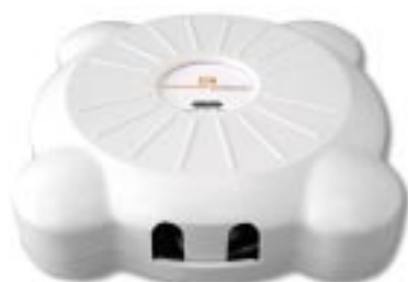
GUARDIAN SENTINEL SIMPLEX TRANSMITTER

Globalstar Quick Locate Service can be accessed through the Internet using one of the two following Globalstar approved products. Both are wireless data devices that integrate the Globalstar Simplex Transmitter Unit and are capable of providing cost-effective and reliable asset tracking, monitoring and fleet management.